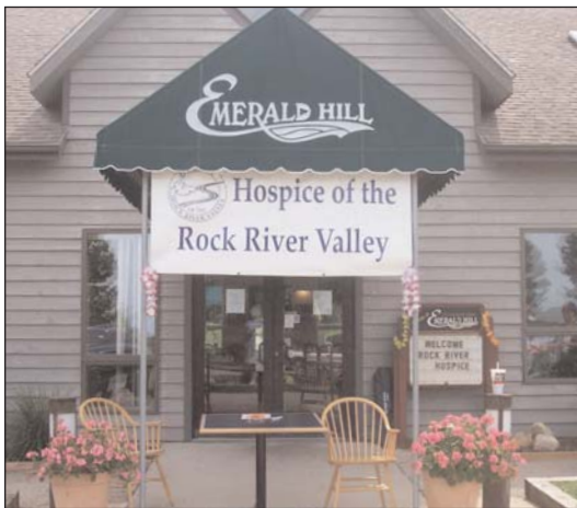
Emerald Hill Golf Course was the host sight for the 9th Annual Hospice of the Rock River Valley Golf Outing on June 24.